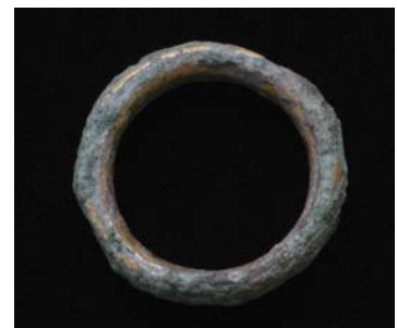
Figure 3: Bronze ring with applied gilding, Phum Snay village, Preah Neat Preah commune, Banteay Meanchey province

During the Iron Age, gold was used in the manufacture of jewelry. Golden beads, rings, and earrings have been found at archaeological sites such as Phum Snay in Banteay Meanchey (see also Richter 2000: 50, and Bunker and Latchford 2008: 432-474). (Figure 3). In the early centuries of the Common Era, the Khmer engaged in international trade using metal currencies; Roman gold and silver coins and jewelry have been found at the archaeological site of the important port and inland city of Angkor Borei, now Oc Eo, in modern-day Southern Vietnam (Malleret 1962). In the post-Angkorian period and modern periods, various Khmer Kings minted silver currency from pure Cambodian silver