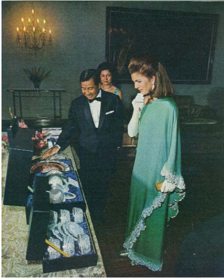
Figure 9: Gold and silver objects offered by the king as gifts to Jacqueline Kennedy at the Royal Palace, Phnom Penh

1967, Norodom Sihanouk presented her with traditional Khmer artifacts made from gold and silver (Figure 9).