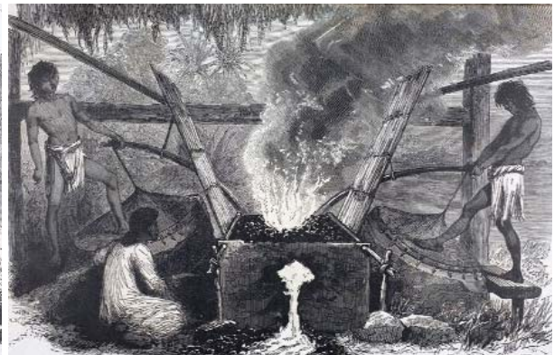
Figure 2: Kui minority - iron foundry

During the Iron Age, gold was used in the manufacture of jewelry. Golden beads, rings, and earrings have been found at archaeological sites such as Phum Snay in Banteay Meanchey (see also Richter 2000: 50, and Bunker and Latchford 2008: 432-474). (Figure 3). In the early centuries of the Common Era, the Khmer engaged in international trade using metal currencies; Roman gold and silver coins and jewelry have been found at the archaeological site of the important port and inland city of Angkor Borei, now Oc Eo, in modern-day Southern Vietnam (Malleret 1962). In the post-Angkorian period and modern periods, various Khmer Kings minted silver currency from pure Cambodian silver