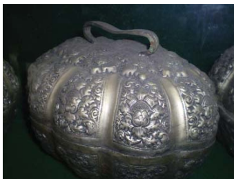
Figure 16: Large pumpkin box worked in silver, Royal Palace, Phnom Penh