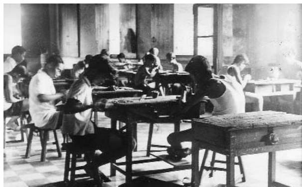
Figure 12: Silversmith students, 1930s

During the French colonial era (1864-1954) many changes took place in the training of artisans and the production of gold and silver artifacts (for more information on this change see Groslier 1926 and Muan 2001). (Figures 12-14). While the Royal Court continued to commission religious images and ritual objects, gold and silver craft workers also produced work that they could sell on the open market to tourists and overseas: silver boxes, jewelry, small animals and other souvenir items decorated with traditional designs of fruit and Angkor-inspired motifs. (Figures 15-16) By the late 1930s, more than six hundred silversmiths were employed filling orders from as far away as Egypt and South America ( http://www.metmuseum.org and Gold Review.com ). The change in scale of production led to the establishment of some factories and the adoption of mechanical techniques such as power tools. Despite these changes, the quality of Khmer silver and gold remained high: objects are typically made from ninety percent pure gold and silver, and hand tools and traditional techniques are used.