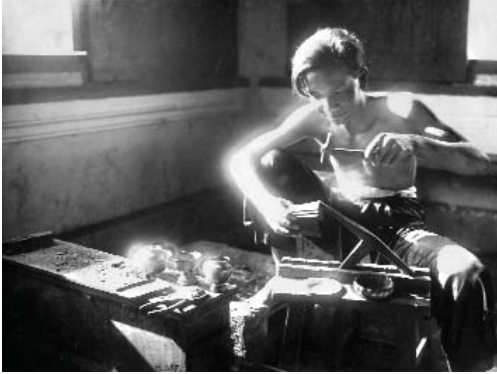
Figure 13: Ecole des arts cambodgiens, silversmith, 1930