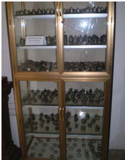
Figure 15: Small chickens, turtles, lions, pumpkins: silver animal boxes in the Royal Palace, Phnom Penh