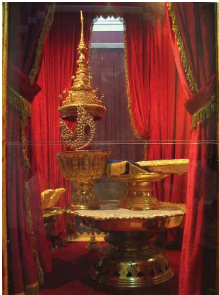
Figure 10: Gold crown and sword for the king, Royal Palace, Phnom Penh

In the past, the Royal Court was the primary consumer of gold and silver artifacts. When the King or the members of the Court rewarded their followers or entertained foreign visitors, they often gave gifts of silver or gold objects such as the betel boxes mentioned above. The Buddha images and ritual objects donated to Buddhist temples by the royal family were often made from precious metals. Some of these royal donations are still in use at wats such as Wat Unnalom; others can be seen in the National Museum (Figures 10-11). These artifacts were produced by the skilled craftsmen who lived and worked in and around the Royal Palace. A group of traditional silversmiths can still be found at Kampong Luong, a village located near Phnom Preah Reachtrop (Oudong), the site of the royal palace from the 15 th to the 19 th centuries. After King Norodom moved from Oudong to Phnom Penh in 1866, many craftsmen followed the court south and took up residence in the area surrounding the Royal Palace. In the past, these craftsmen worked exclusively for the Royal Palace and court. Today, in addition to working on royal commissions, Cambodian gold and silversmiths repair antiques and make souvenirs for the tourist trade and for export.