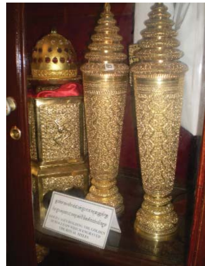
Figure 11: Gold caskets holding golden scrolls on which are engraved the royal titles, Royal Palace, Phnom Penh