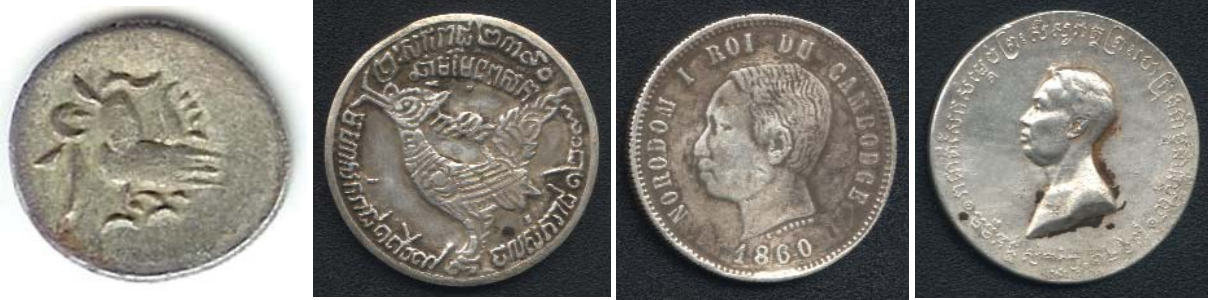
Figure 4: Fuang, Ang Duong period, 1847, minted in pure silver (See from left to right)

(Figures 4-7). In addition to being used for jewelry and trade, gold and silver were important for ritual and religious activities. Two early examples are the seventh-century statue of Nandin made from cast silver of eighty-percent purity, found at Tuol Kuhea, Koh Thom district, and an eighth-century silver head of Vishnu from Sambor Prei Kuk.