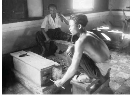
Figure 14: Ecole des arts cambodgiens, goldsmith, 1930