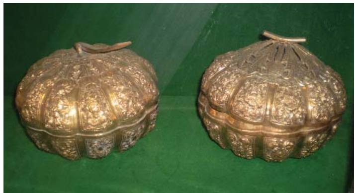
Figure 8: Pumpkin boxes worked in gold, similar to those offered by the king as gifts to foreigners who visited him in the late 19 th century, Royal Palace, Phnom Penh

During the Angkorian period, Cambodia’s silver-working tradition can be said to have reached its height. Gold and silversmiths manufactured beautiful artifacts for the Royal Court: weaponry, ceremonial objects, religious images, jewelry and coins and betel boxes. Betel boxes are containers used to hold the materials for betel chewing, an important social ritual in Cambodia and Southeast Asia (Rooney 1994). In Cambodia, betel boxes were often made from silver in the shape of animals or fruits. The earliest evidence for these animal-shaped vessels dates back to the eleventh century. Zhou Daguan (Chou Ta-Kuan), a Chinese envoy who spent a year at Angkor in A.D.1296-7, saw “girls carrying gilt and silver vessels from the palace and a whole galaxy of ornaments, of very special design, the uses of which were strange to me” (Matics 2002: 4-5). The Khmer king often gave these betel boxes to foreigners who visited him (Vincent 1873: 295; see also Knox 1880). Figure 8 illustrates a gift box made from native gold and silver stained with red, having the shape of a Cambodian pumpkin, the top of which was carved in a cluster of leaves. This tradition continued into the modern period: when Jacqueline Kennedy visited Cambodia in