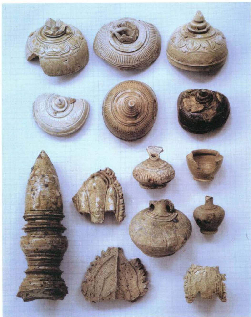
Figure 8. Ceramic objects recovered at the Thnal Mrec kiln site, Phnom Kulen