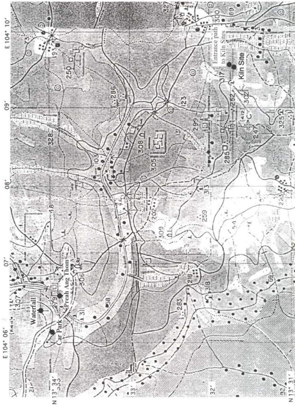
Figure 7. Kulen sites plotted by GPS readings on map published in J. Boulbet, Le Phnom Kulen et sa région , Collection de textes et documents sur l'Indochine XII, EFEO, Paris, 1979