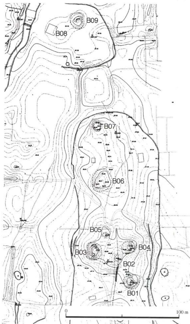
Figure 4. Kiln remains and their designation (northern half of the area)