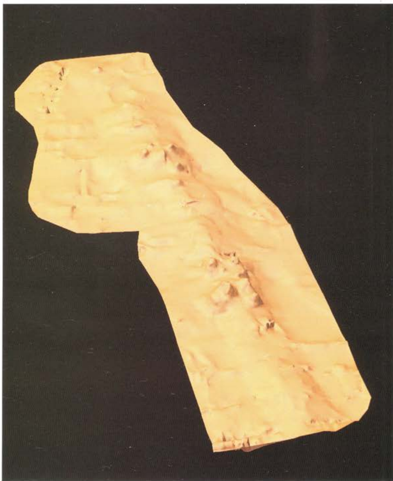
Figure 1. Computer-generated bird's-eye view of the Tani kiln site, seen from the southwest

As noted at the beginning of this report, full-scale research has never been carried out at the Kulen kiln site. The extent of distribution of the kilns, and their operating period remain speculative. We urge that concerned researchers join together to expand on this and other initial surveys in view of addressing many of the issues raised in this report and, more generally, in research of Khmer ceramic production currently being undertaken on the Angkor plain. One vital result of research intervention will of course be protection of the site from further destruction by looters.