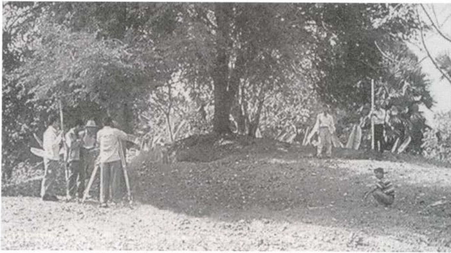
Figure 5. Survey work at kiln A01, seen from the north