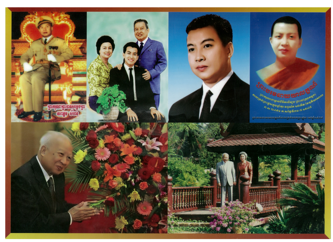
Figure 1. An A3 laminated montage poster, purchased by the author in the aftermath of Sihanouk's death.