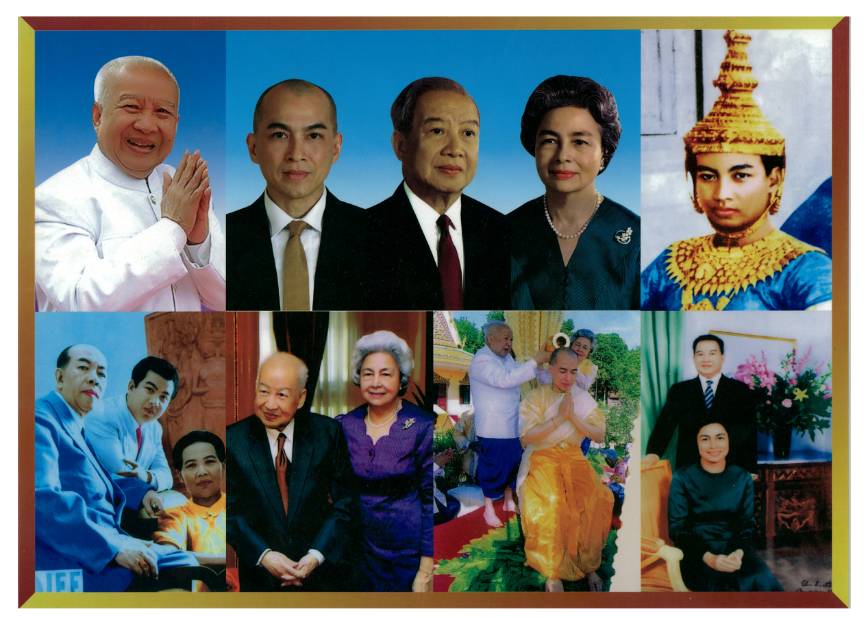
Figure 8. An A3 laminated montage bought in Phnom Penh during Sihanouk's funeral. February 2013.

Penh on the morning of Sihanouk's cremation, when his face was seen by a group of around thirty yiey chi (renunciant women) in the haze of the sun immediately to the north of the cremation area. At the same time a female medium walked amongst the assembled women telling each of them that Sihanouk was watching them. During the actual cremation his face was again seen in the smoke rising from the purpose-built atrium by Cambodian onlookers, both young and old, and some documented it in photographs and video. Immediately after the ceremony these images were shared on Facebook and mourners expressed the desire to buy the image as a photo-poster the following day. It was widely held by those who believed they had seen his face that this apparition signaled that he was watching over the people, protecting them and Cambodia, but that after his cremation his face would no longer appear to them. That Sihanouk was no longer able to cast a protective gaze over Cambodia added a sense of urgency of the circulation and "black market" consumption of his portrait.