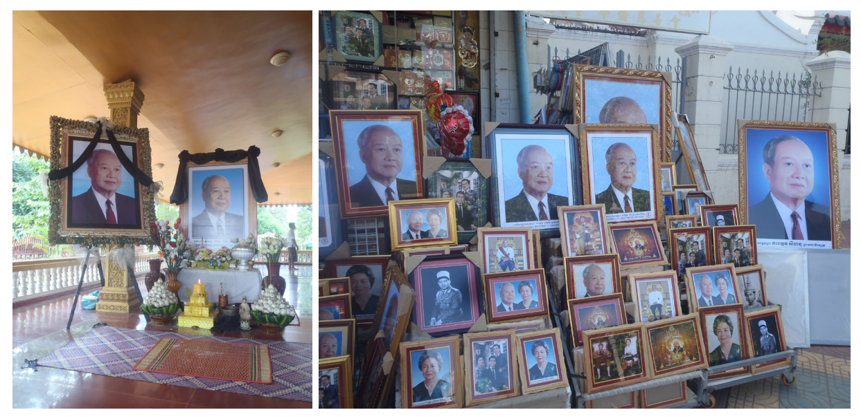
Figure 2. Two official portraits of Sihanouk installed at Preah Ang Chek and Preah Ang Chom in Siem Reap, December 2012. Photograph by author. (Left) Figure 3. Shop front in Battambang, October 25, 2013. Photograph by author. (Right)

been digitally altered, his face now shadow-less and wrinkle-free, his hair a solid grey mass. In each version his suit and shirt are different colors. At Preah Ang Chek and Preah Ang Chom, popularly known as Neang Chek Neang Chum, a shrine situated in front of the royal residence in Siem Reap,<sup>6</sup> these same portraits were situated side-by-side, each surrounded by a digitally-rendered ornate gold frame. The second portrait is also set within an actual gilt frame. This act of framing creates a critical space between the king and his subjects, creating and maintaining a sense of aura in the image.<sup>7</sup> Businesses often set up small altars in front of this photo-portrait, whilst ones displayed outside official buildings were draped in black and white cloth. These portraits were also sold in print shops across Cambodia.