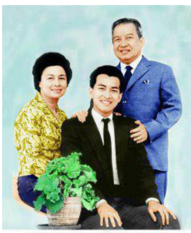
ອຸດອີລິ ອະດອັຊ ຊຶ່ງການແຮງຂອນປະ ມີຊຸດອີລິ ອອູດເລ ຊຶ່ງກະການເງິດຊາກ. ອັຊເດເລີ ອົຊເດລ ກອບແຮງ ຂອນເຮັງ ອີຊາກ ຊຶ່ງການຮວງ ມີ

Cambodia, or indeed elsewhere, as hand-coloring existed from the very birth of photography, until color film became readily available in the 1950s and 1960s. The National Archives of Cambodia in Phnom Penh hold examples of monochrome photographs of Sihanouk's official portraits where color has been added by hand. However, as technology has advanced, so have the modes of manipulation and circulation; anyone with access to a photo-editing program, such as Adobe Photoshop, can remake an image and share it on social media. The photo-posters and the images shared online converge with the wider explosion of photography in Cambodia, due to the rise of digital technology, smart phones, and internet access.