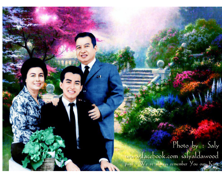
Figure 7. Family portrait, digitally enhanced, which circulated widely on Facebook in early 2013.

by extension, a particular version of twentieth-century Cambodian history, utilizing these "narratedportraits."9 In his archeology of new media technologies, Lev Manovich notes the centrality of montage in the construction of fake realities in the twentieth century, sometimes exploited for ideological purposes.<sup>10</sup> In this context the assemblages of photographs were instrumentalized as narratives of a version of Cambodian history, as embodied by the figure of Sihanouk, and which distil the person of Sihanouk into two over-arching narratives: a meritorious Buddhist king and the father of the modern nation-state. As far as it is possible to discern,