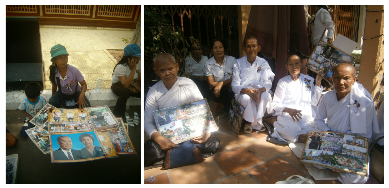
Figure 4. A photo-poster vendor outside Veal Mean, Phnom Penh, February 2, 2013. Photograph by author. (Left) Figure 5. A group of yiey chi from different provinces. Phnom Penh, February 2, 2013. Photograph by author. (Right)

In Siem Reap these A3 posters, along with smaller laminated pins of Sihanouk, were sold at Neang Chek Neang Chum and in local markets. In Phnom Penh it was largely street vendors, poorer families and children, who otherwise hawk street snacks or panhandle, who sold stacks of these posters to mourners during the funeral for around 3000 riel (75 cents) each. The vendors replenished their stock at local print shops each night, when montages containing the latest scenes from the funeral went on sale. In informal interviews with print shop owners I was told that the circulation of images on Facebook allowed them to be downloaded instantly, printed, before or after digital manipulation, and sent out to be sold. Street vendors I spoke to in Phnom Penh were selling around forty to fifty laminates per day during the five-day funeral. Buyers consisted of families who had travelled from as far away as Banteay Meanchey, monks and renunciant women, students and young factory workers who migrated to Phnom Penh from bordering provinces.