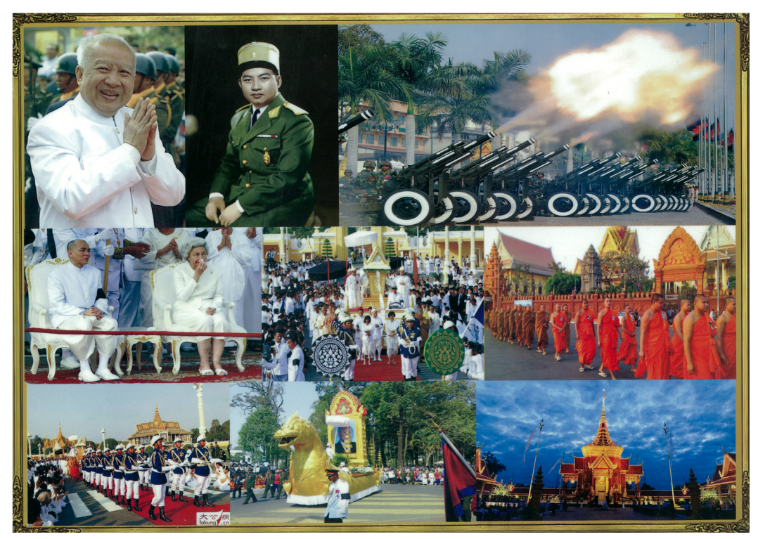
Figure 10. An A3 laminated montage poster, purchased during the funeral of Sihanouk.