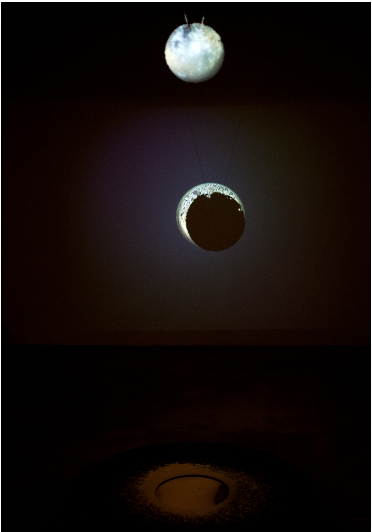
Yim Maline, No Name , 2012, mixed media installation with single-loop video (duration: 3:45 min.), dual sound channels, milk, circular wooden platform with metallic disc in the middle and contact microphone. Installation view at SA SA BASSAC, Phnom Penh, 2012.

No Name's video Link: http://yosothor.org/publications/udaya-journal-of-khmer-studies-ojs/yim_maline_video.html